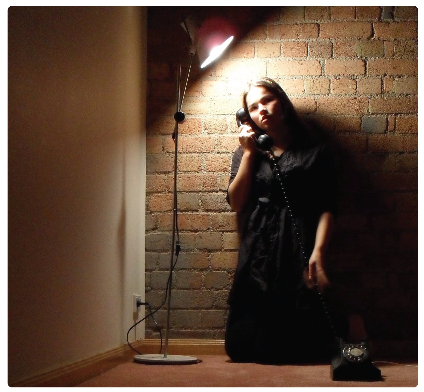
© Tess McKaige Shining in the light 2010

do so and have the violent perpetrators removed.