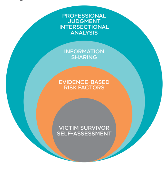
Figure 3: Model of Structured Professional Judgement